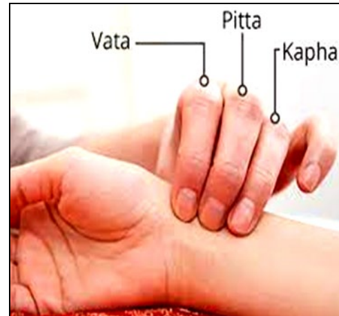
Fig 1: Diagnosis of Nadi